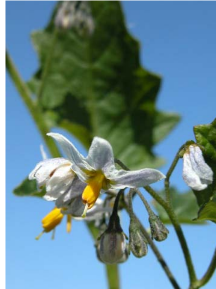
Black Nightshade Solanum nigrum Introduced Annual Nightshade Family