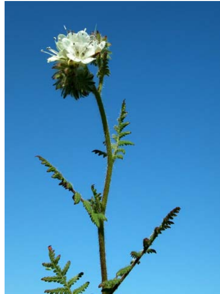
Wild Heliotrope Phacelia Phacelia distans Native Annual Waterleaf Family