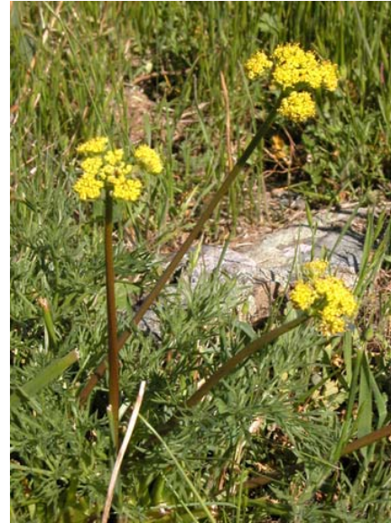
Caraway-leaf Biscuit Root Lomatium caruifolium var. caruifolium Native Perennial Carrot Family