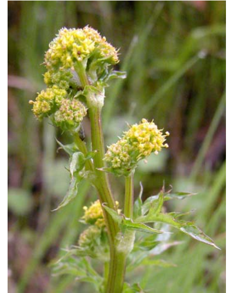
Pacific Woodland Sanicle Sanicula crassicaulis Native Perennial Carrot Family