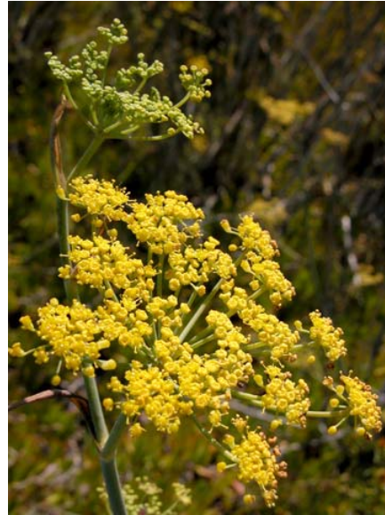
Sweet Fennel Foeniculum vulgare Introduced Perennial Carrot Family