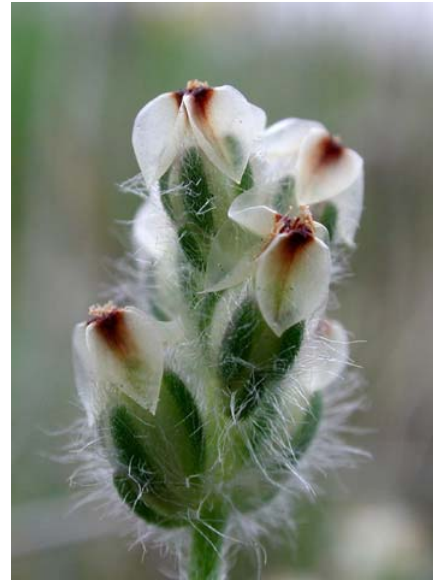
California Dwarf Plantain Plantago erecta Native Annual Plantain Family