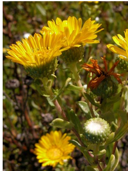
Narrowleaf Pacific Gumplant Grindelia stricta var. angustifolia Native Perennial Sunflower Family