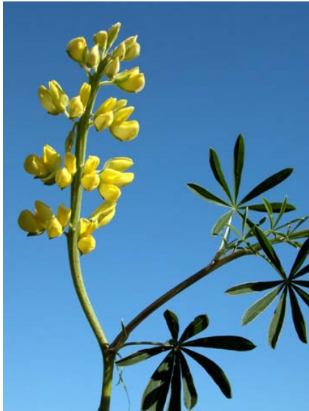
Yellow Bush Lupine Lupinus arboreus Native Perennial Pea Family