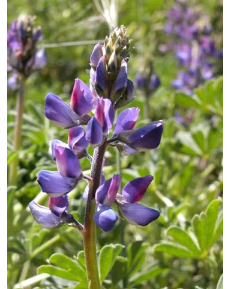
Arroyo Lupine Lupinus succulentus Native Annual Pea Family