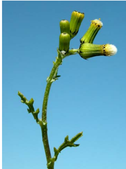
Common Groundsel Senecio vulgaris Introduced Annual Sunflower Family