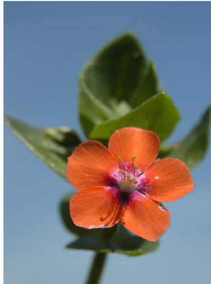
Scarlet Pimpernel Anagallis arvensis Introduced Annual Primrose Family