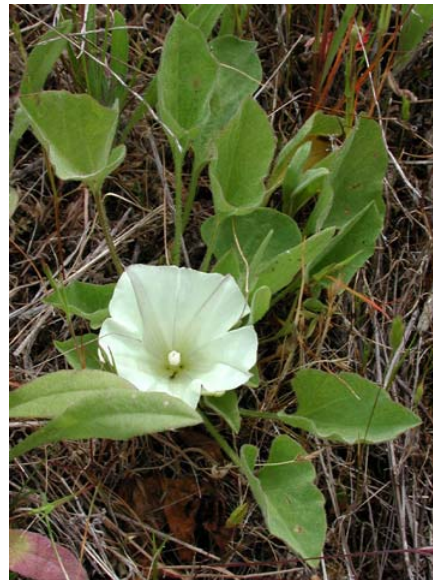
Shortstem Morning Glory Calystegia subacaulis ssp. subacaulis Native Perennial Morning-Glory Family