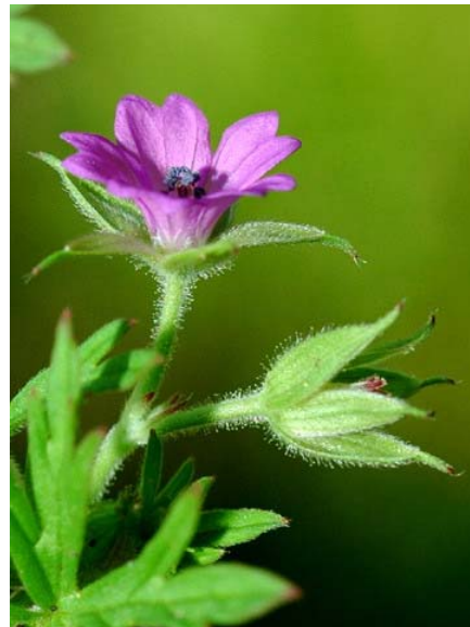
Purpletip Cut-leaf Geranium Geranium dissectum Introduced Annual Geranium Family