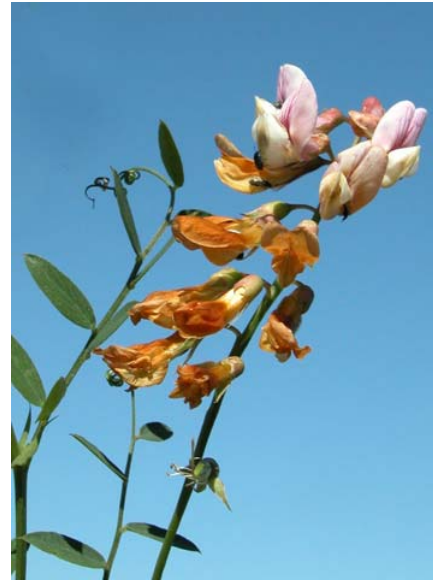
Pale Purple Pacific Pea Lathyrus vestitus var. vestitus Native Perennial Pea Family