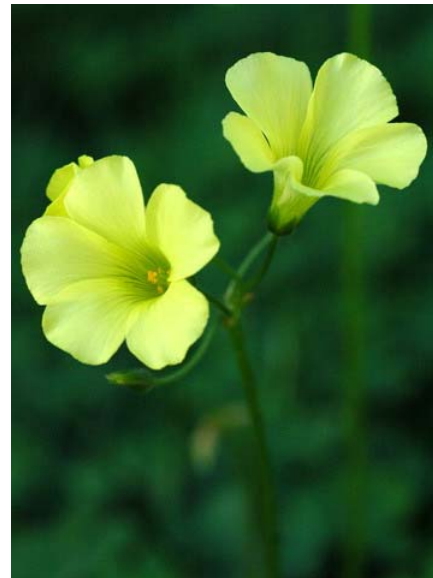
Bermuda Buttercup Oxalis pes-caprae Introduced Perennial Oxalis Family