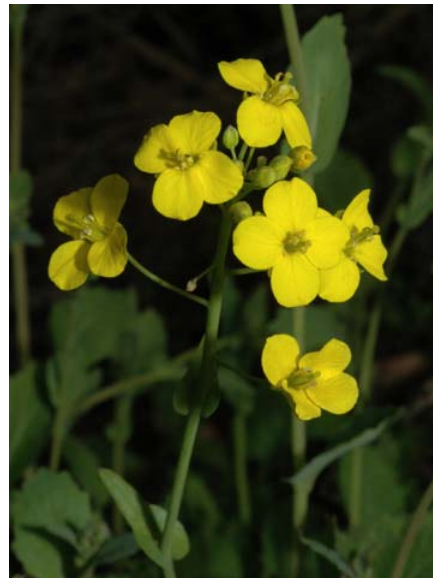
Yellow Field Mustard Brassica rapa Introduced Annual Mustard Family