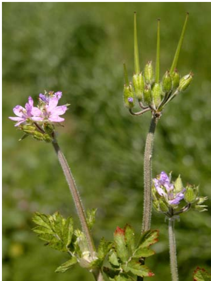
White-stem Filaree Erodium moschatum Introduced Annual Geranium Family