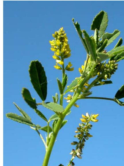
Sour Clover Melilotus indica Introduced Annual-Biennial Pea Family