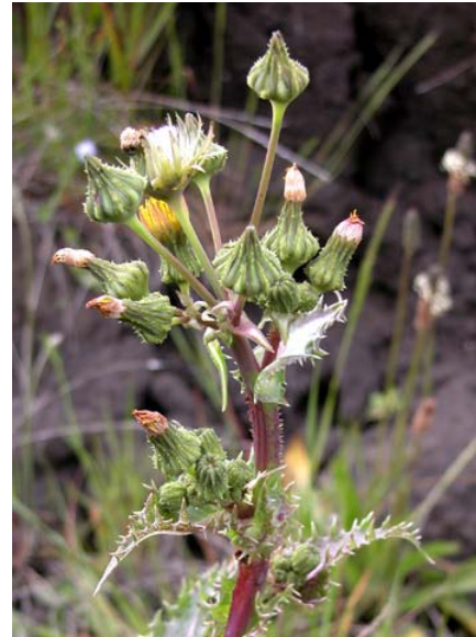
Prickly Sow Thistle Sonchus asper ssp. asper Introduced Annual Sunflower Family