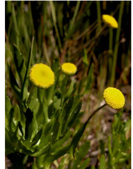
Brass Buttons Cotula coronopifolia Introduced Perennial Sunflower Family