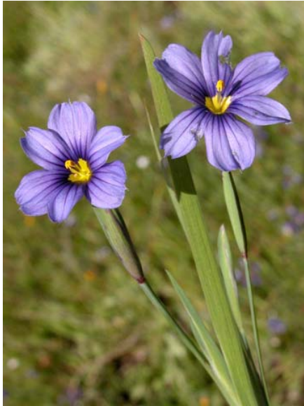
Blue-eyed Grass Sisyrinchium bellum Native Perennial Iris Family