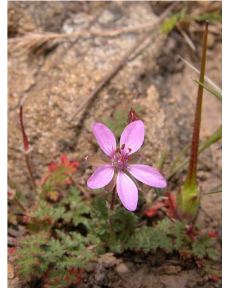
Red-stem Filaree Erodium cicutarium Introduced Annual Geranium Family