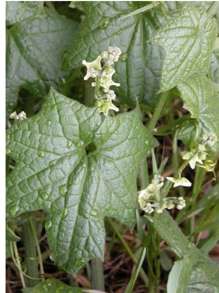
Common / California Manroot Marah fabaceus Native Perennial Gourd Family