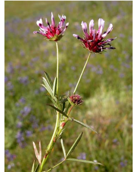
Tomcat Clover Trifolium willdenovii Native Annual Pea Family