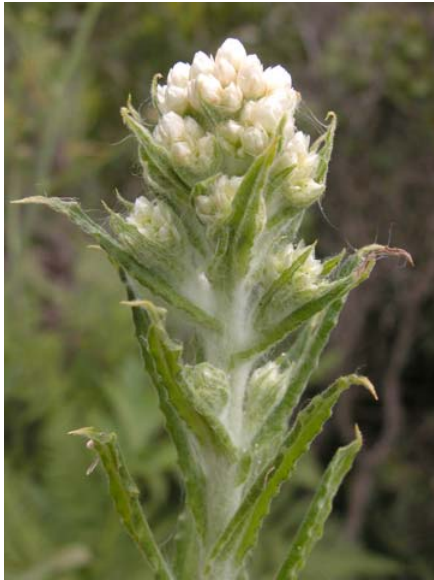
California Everlasting Gnaphalium californicum Native Biennial Sunflower Family