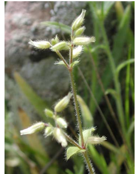
Mouse-ear Chickweed Cerastium glomeratum Introduced Annual Pink Family