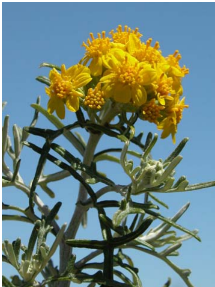
Seaside Woolly Sunflower Eriophyllum staechadifolium Native Perennial Sunflower Family