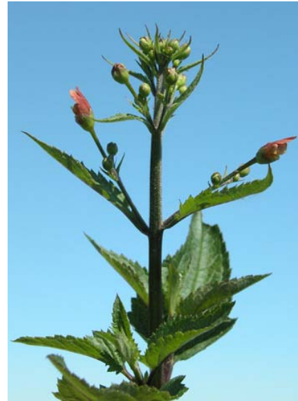
California Figwort Scrophularia californica ssp. californica Native Perennial Snapdragon Family