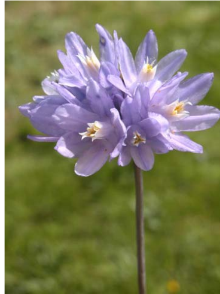
Blue Dicks Dichelostemma capitatum ssp. capitatum Native Perennial Lily Family