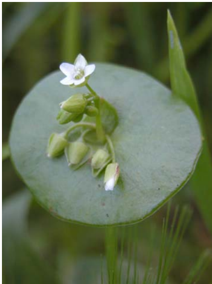
Common Miner's Lettuce Claytonia perfoliata ssp. perfoliata Native Annual Purslane Family