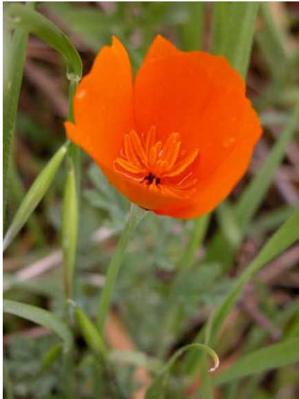
California Poppy Eschscholzia californica Native Perennial Poppy Family