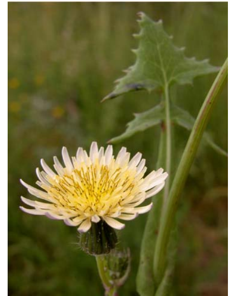
Common Sow Thistle Sonchus oleraceus Introduced Annual Sunflower Family