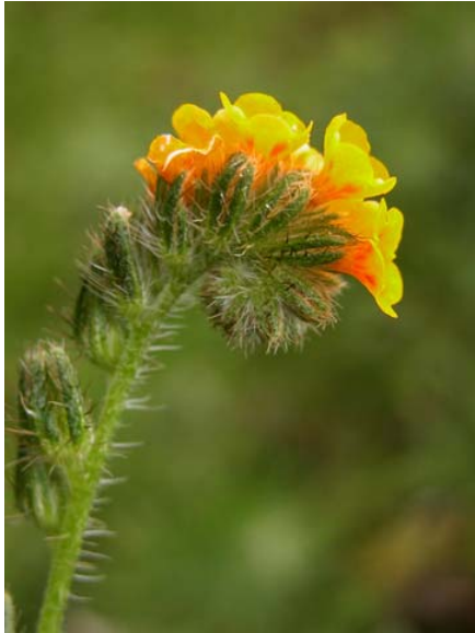
Common Fiddleneck Amsinckia menziesii var. intermedia Native Annual Borage Family