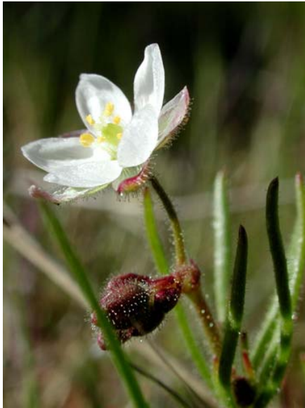
Stickwort Spergula arvensis ssp. arvensis Introduced Annual Pink Family