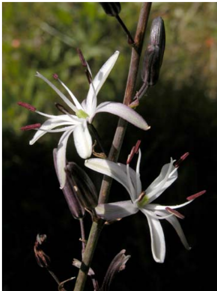
Common Soap Plant Chlorogalum pomeridianum var. pomeridianum Native Perennial Lily Family