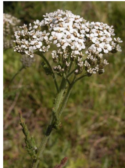
Yarrow Achillea millefolium Native Perennial Sunflower Family