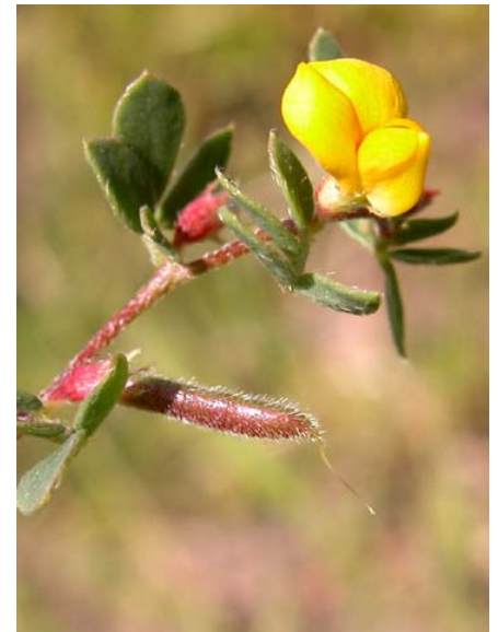
California Lotus Lotus wrangelianus Native Annual Pea Family