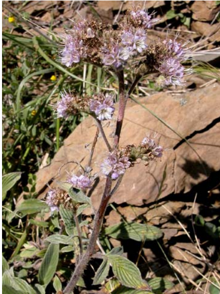
California / Rock Phacelia Phacelia californica Native Perennial Waterleaf Family