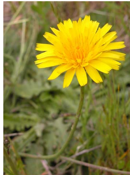
Rough Cat's-ear Hypochaeris radicata Introduced Perennial Sunflower Family