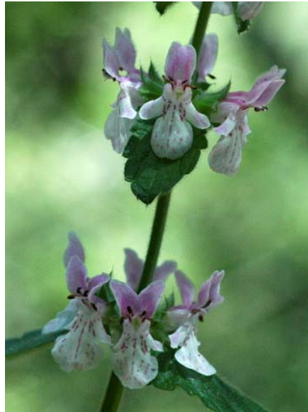
Common Rigid Hedge Nettle Stachys ajugoides var. rigida Native Perennial Mint Family