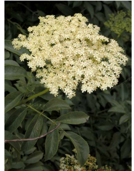
Blue Elderberry Sambucus mexicana Native Perennial Honeysuckle Family