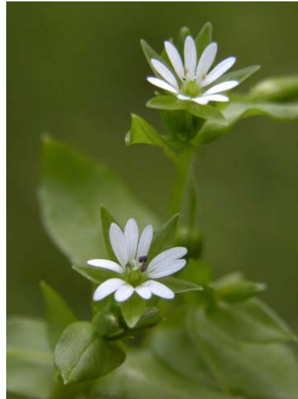
Common Chickweed Stellaria media Introduced Annual Pink Family