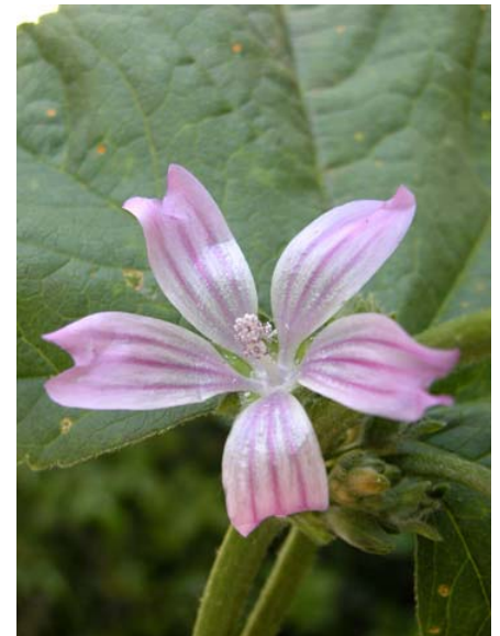
Bull Mallow Malva nicaeensis Introduced Annual Mallow Family