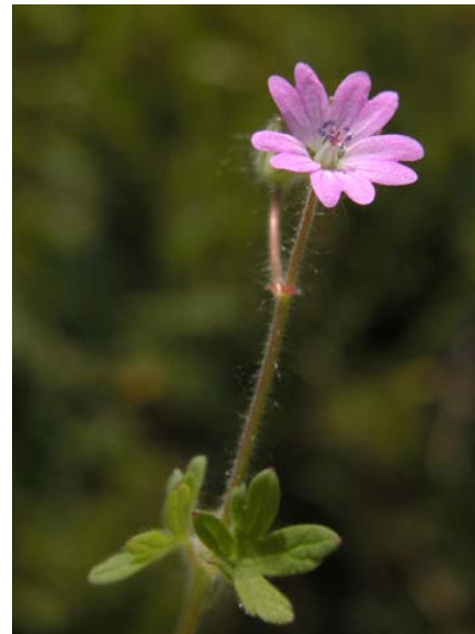
Hairy Dove's Foot Geranium Geranium molle Introduced Annual Geranium Family