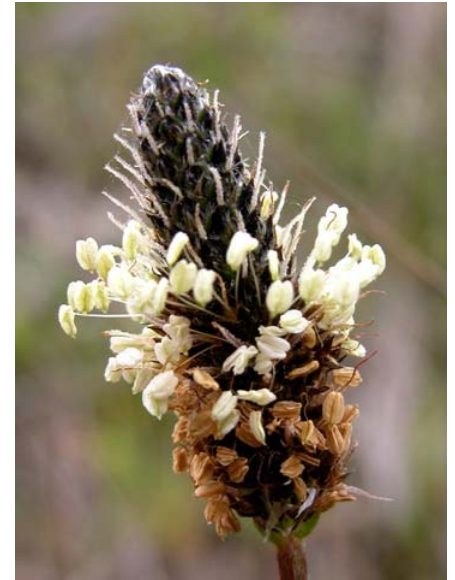
English Plantain Plantago lanceolata Introduced Annual Plantain Family