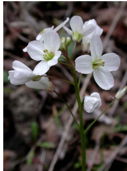
Milkmaids Cardamine californica Native Perennial Mustard Family