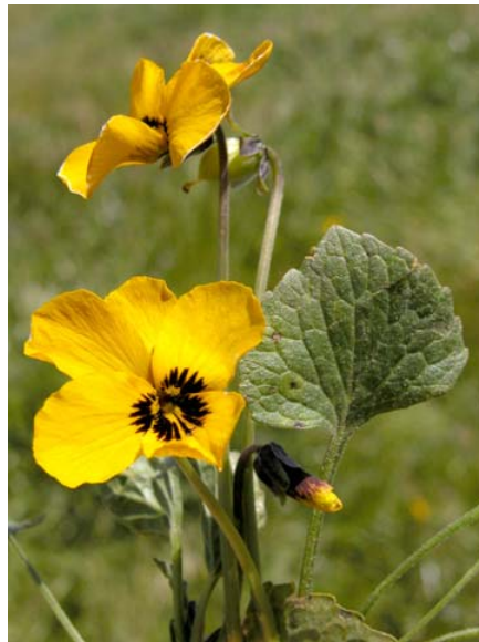
Johnny-Jump-Up / Wild Pansy Viola pedunculata Native Perennial Violet Family