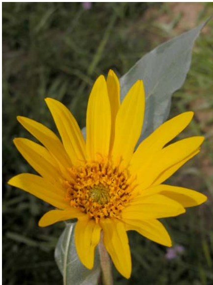
Narrow-leaf Mule's Ear Wyethia angustifolia Native Perennial Sunflower Family