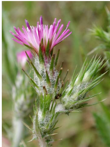
Italian Thistle Carduus pycnocephalus Introduced Annual Sunflower Family