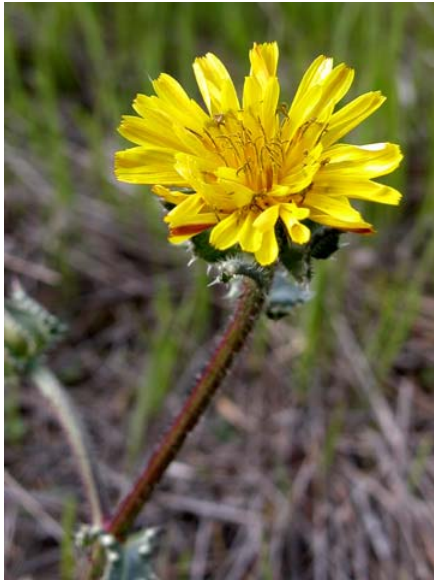
Bristly Ox-tongue Picris echioides Introduced Annual-Biennial Sunflower Family