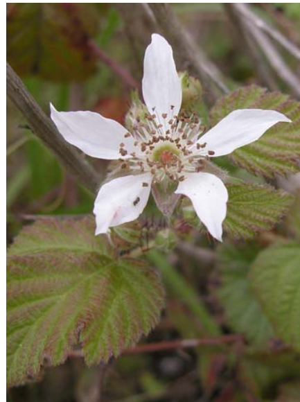
Native California Blackberry Rubus ursinus Native Perennial Rose Family