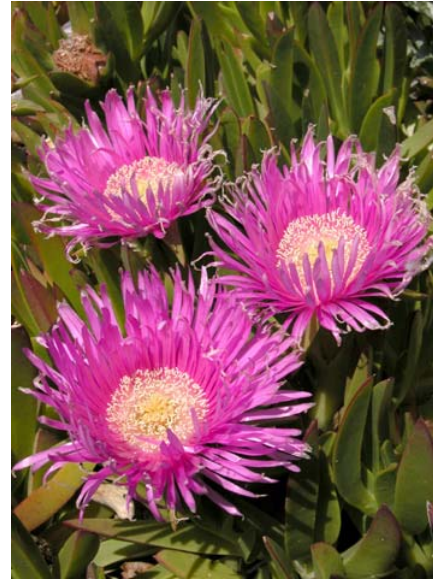
Sea Fig Carpobrotus chilensis Introduced Perennial Fig-Marigold Family