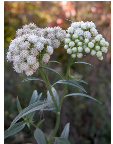
Douglas/Salt Marsh Baccharis Baccharis douglasii Native Perennial Sunflower Family